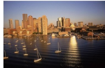
15 th Annual NMPRA National Meeting October 15th, 2011 Boston, MA

The Program Representative is a position available through NMPRA this year. We are asking every Med-Peds Residency Program to elect one resident to this position in an effort to foster awareness of NMPRA programs and increase communication between the NMPRA executive committee and every Med-Peds resident. The Program Representative will receive direct communications from the NMPRA executive committee and act as a channel for bringing ideas and happenings from individual residency programs and regions to national attention. Please contact your program director if you have interest in serving as a program representative!