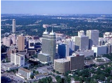
Southern Conference April 16th, 2011 Houston, TX Sponsored by Baylor and UT Houston

SAVE THE DATE TO ATTEND YOUR REGIONAL MEETING THIS YEAR!